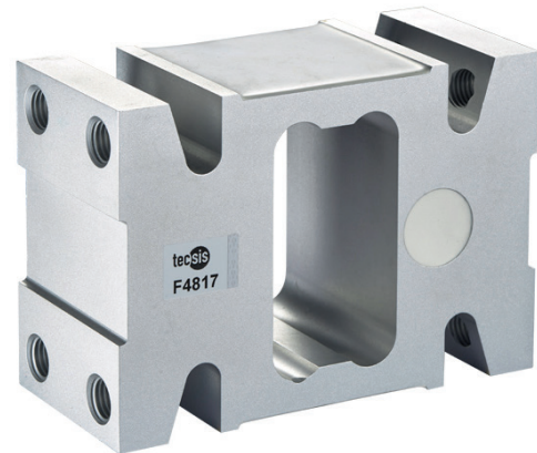
Single point load cell, model F4817